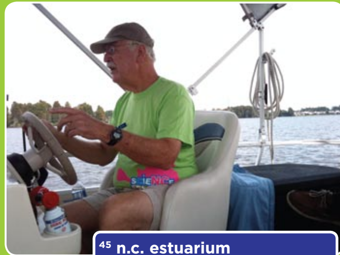
45 n.c. estuarium

ON THE COVER (clockwise from the top): STEMulating the Mind, UNC Science Expo, BugFest 2010, “An Afternoon With Adam and Jamie,” UNC Science Expo, The science of beer at Big Boss Brewery, “An Afternoon With Adam and Jamie.”