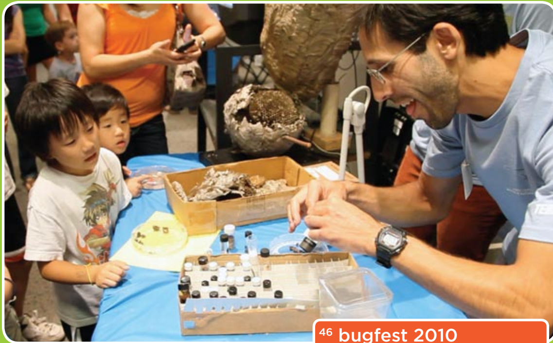
46 bugfest 2010

16> Carolina Beach State Park, Carolina Beach, Animals of the Park, Carnivorous Plant Hike, Poisonous Plants and Animals, River Exploration Hike.