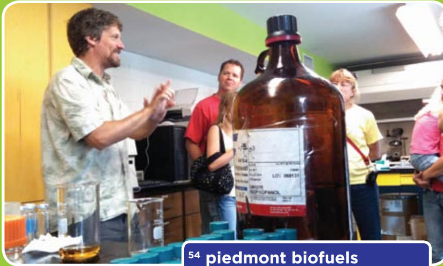
54 piedmont biofuels

The North Carolina Science Festival is a statewide celebration of science and its impact on education, culture and economics within North Carolina. The first North Carolina Science Festival spanned Sept. 11-26, 2010 and was the first-ever statewide science festival in the United States. UNC's Morehead Planetarium and Science Center founded and coordinates the festival, with participation by museums, parks, community sites and other facilities throughout the state.